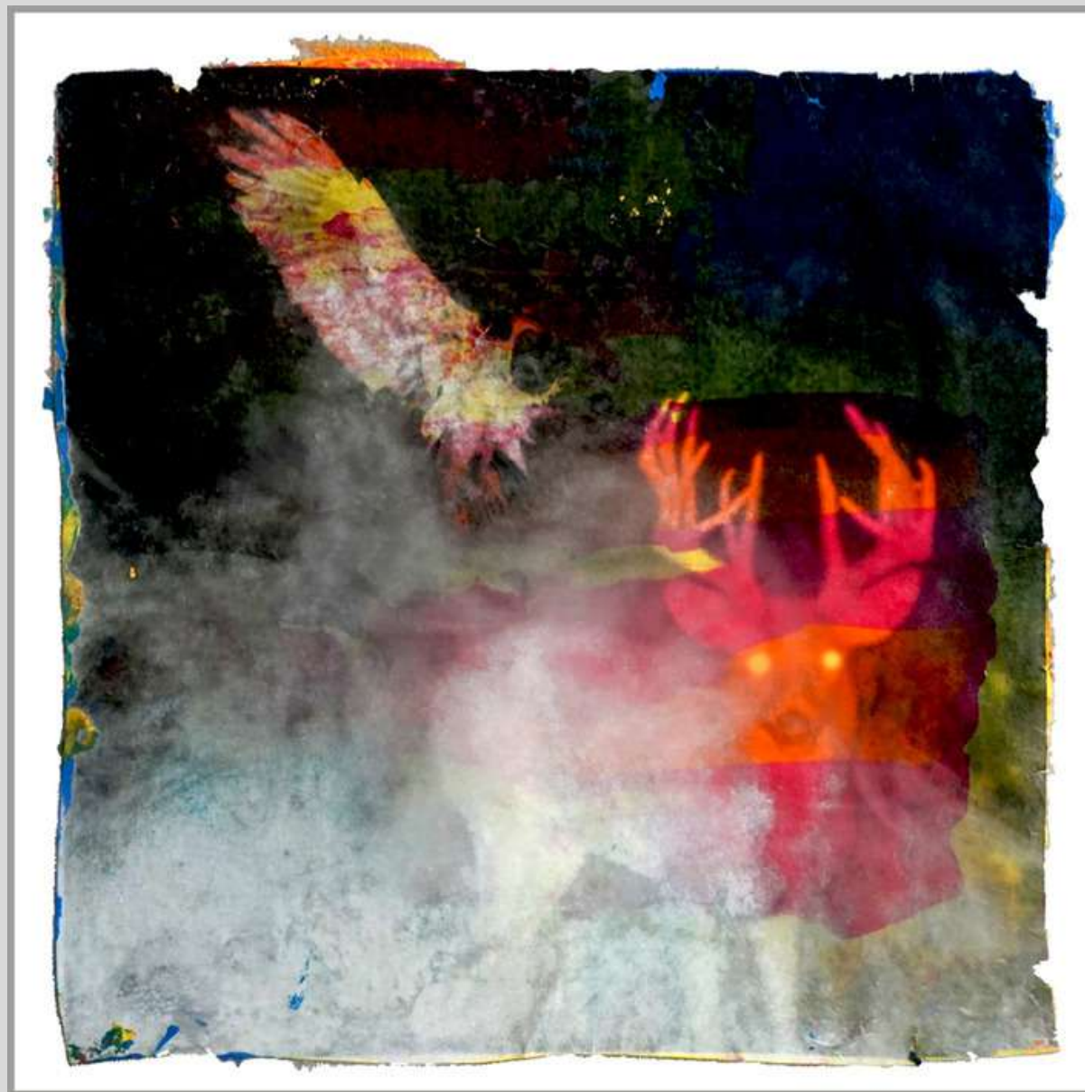
A Secret Life of Animals #16 Digital print, limited edition