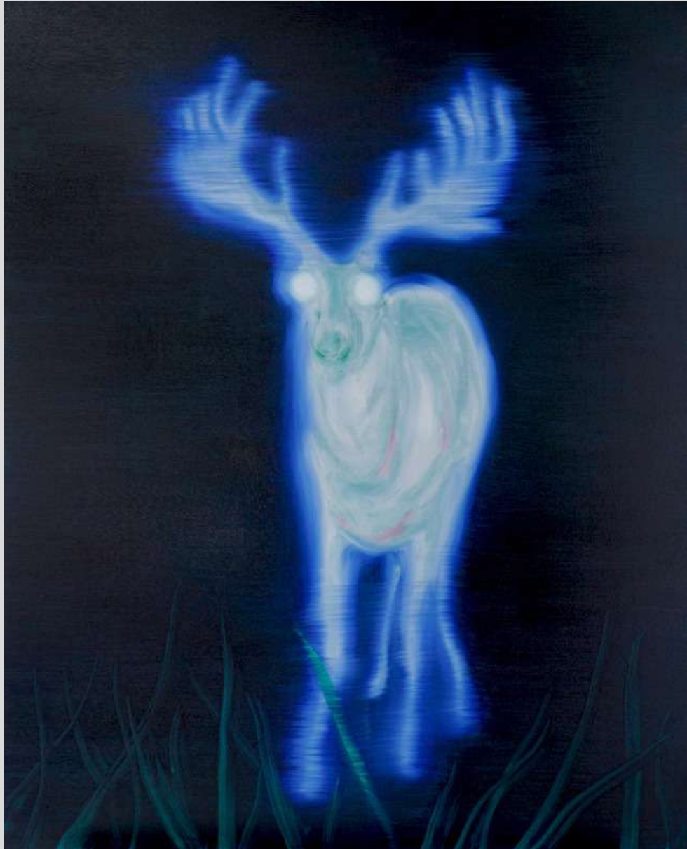
A Secret Life of Animals – Blue Deer Oil on canvas 39,3 x 31,8 in 100 x 81 cm