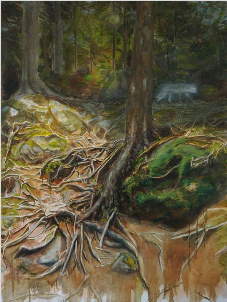
A Secret Life of Animals – White Wolf