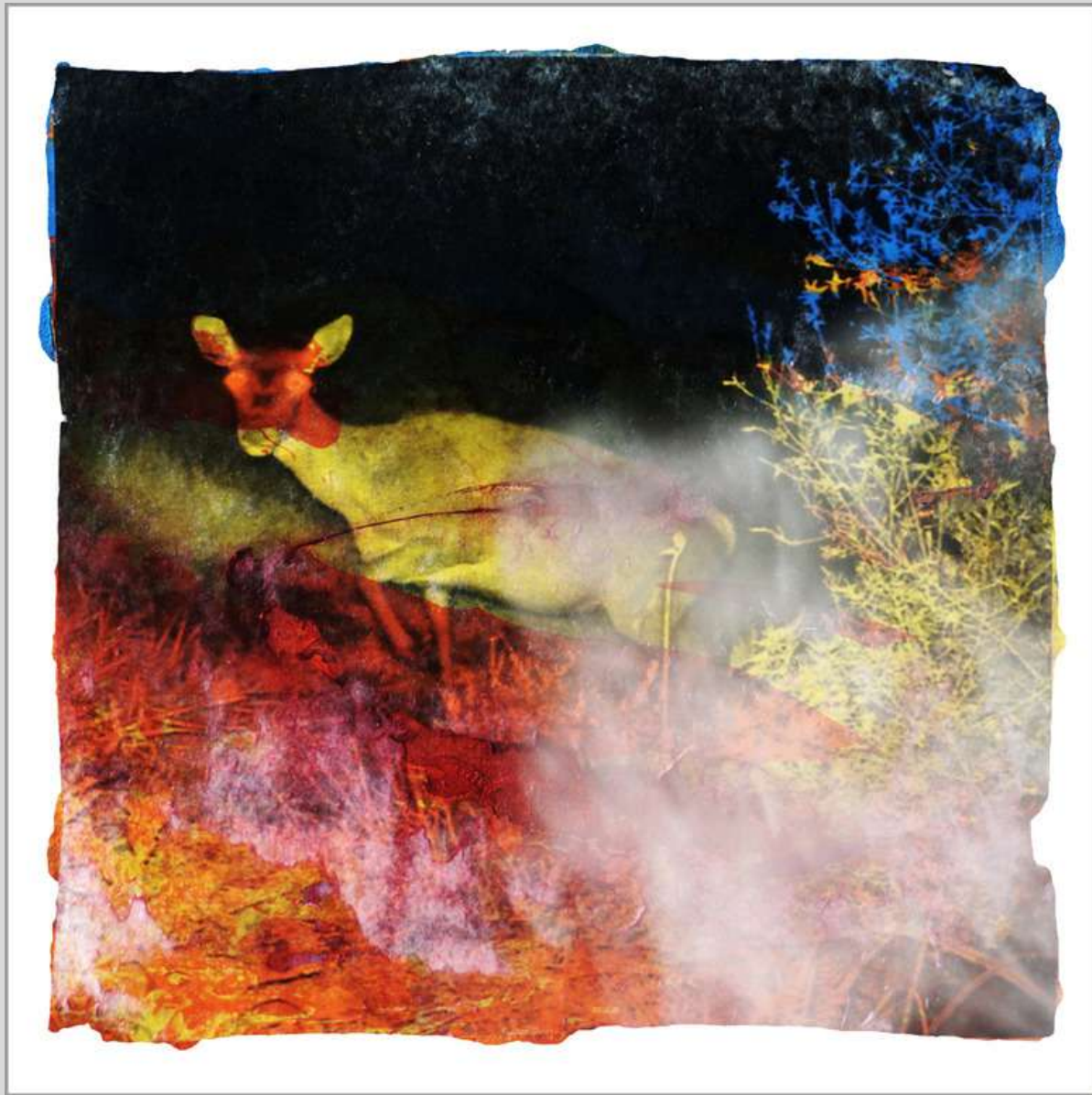
A Secret Life of Animals #22 Digital print, limited edition