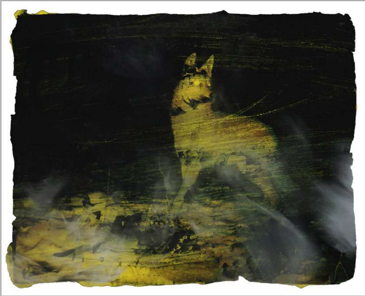
A Secret Life of Animals #39 Digital print, limited edition