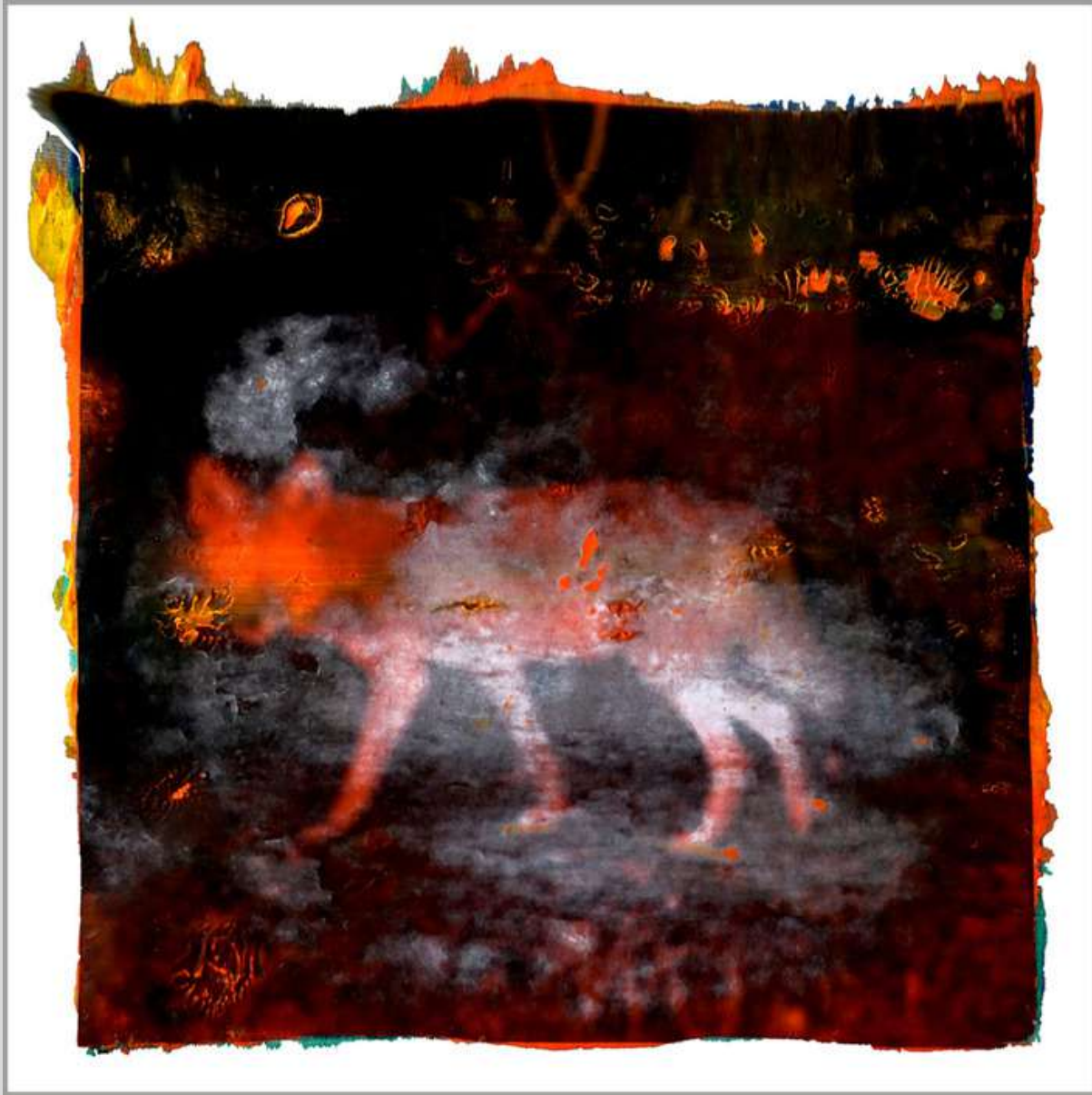
A Secret Life of Animals #7 Digital print, limited edition