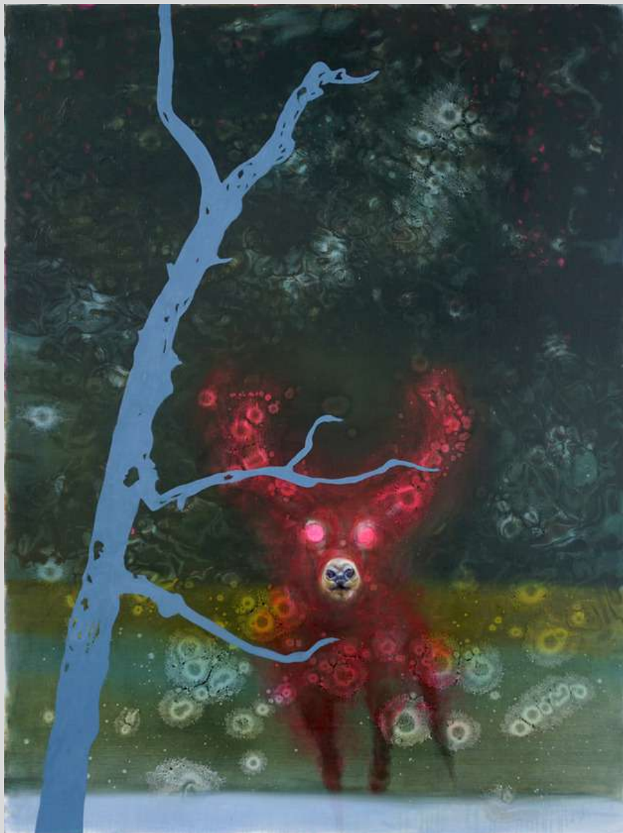
A Secret Life of Animals – Red Deer Acryl and oil on canvas 51,1 x 38,1 in 130 x 97 cm